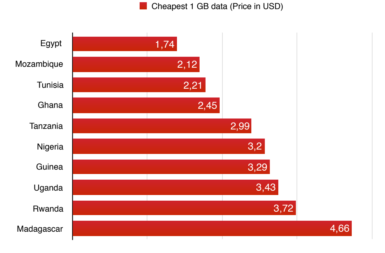
Figure 1: Cheapest 1 GB data in 10 African Countries (Price in USD)

Compared with the best performer, Egypt (USD 3.13), prices in Rwanda were USD1.07 more expensive. Even though the cost of 1GB of data continued to decline over time, Rwanda was overtaken by Tanzania which offered the best price in Q2 2016. Rwanda was later overtaken by Nigeria and Tunisia, ending up in 9th position by Q4 2016 when the price of 1GB was USD3.72; nearly two US dollars higher than the 1st-ranked country, Egypt (USD1.74).